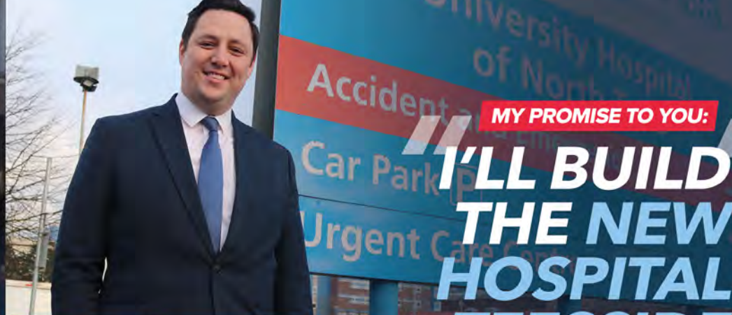
A PROMISE OF MORE: WHAT WE'LL DO NEXT

1. Build a new state-of-the-art hospital to replace the crumbling North Tees Hospital.